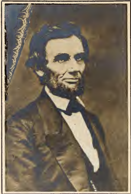
ABRAHAM LINCOLN (Meserve No. 35)