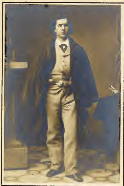
E. ELMER ELLSWORTH